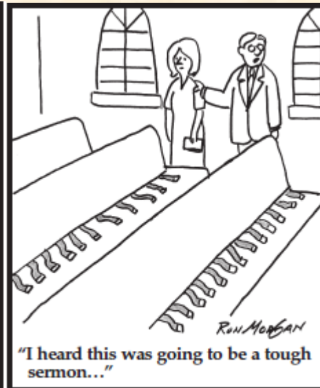
from JoyfulNoiseletter.com